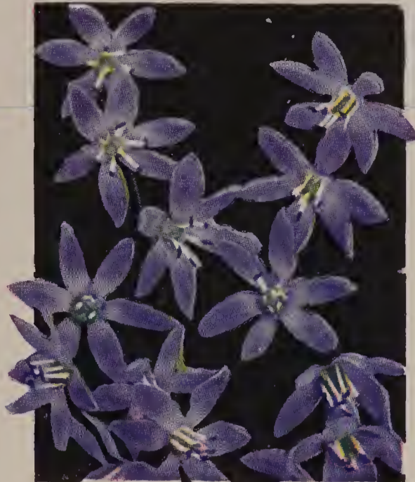
Scilla sibirica, Blue